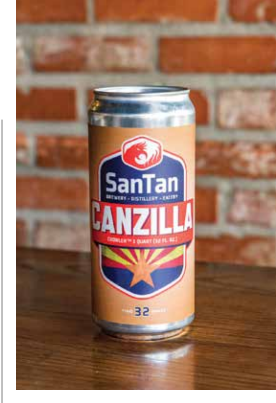
SanTan's "Canzilla" represents about 5 to 7 percent of the brewery's sales, but doubles over the summer.

ies. Yet during the recent mandatory shutdowns, many states, including California and Colorado, relaxed laws to allow retail shops to sell growlers and Crowler cans.